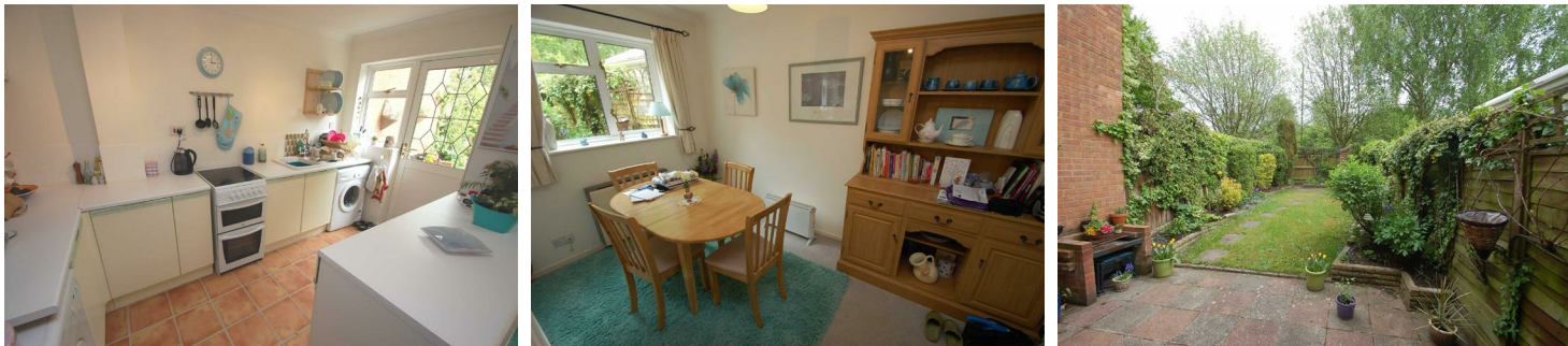
Ground Floor Approx. 35.4 sq. metres (381.0 sq. feet)

A well presented three bedroom family home in a much sought after location close to very popular schools including Wheatfields and Sandringham. The property benefits from an open plan kitchen/diner, double glazing, a garage-en-bloc and having NO CHAIN. Wheat Close is approximately one and three quarter miles from the City Centre although has excellent local facilities nearby within Marshalswick.